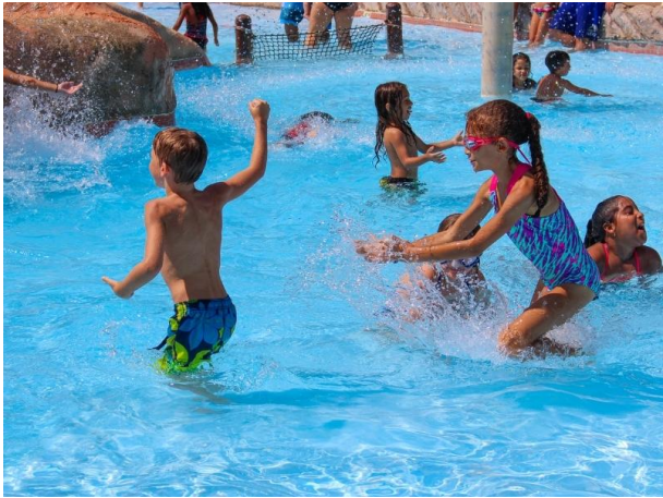
ZERO INCH DEPTH ENTRY